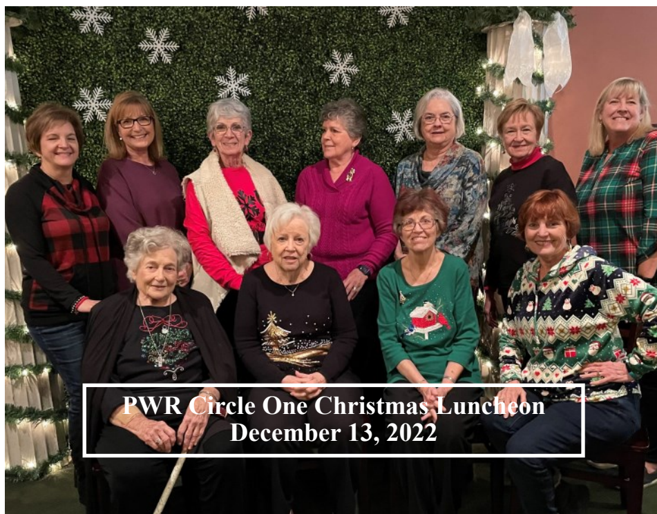
PWR Circle One Christmas Luncheon December 13, 2022